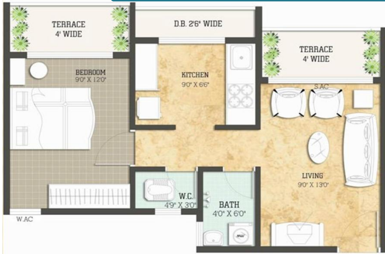
TYPICAL 1BHK FLAT