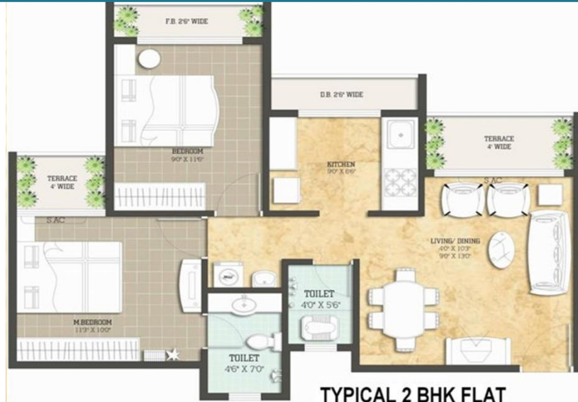
TYPICAL 2 BHK FLAT